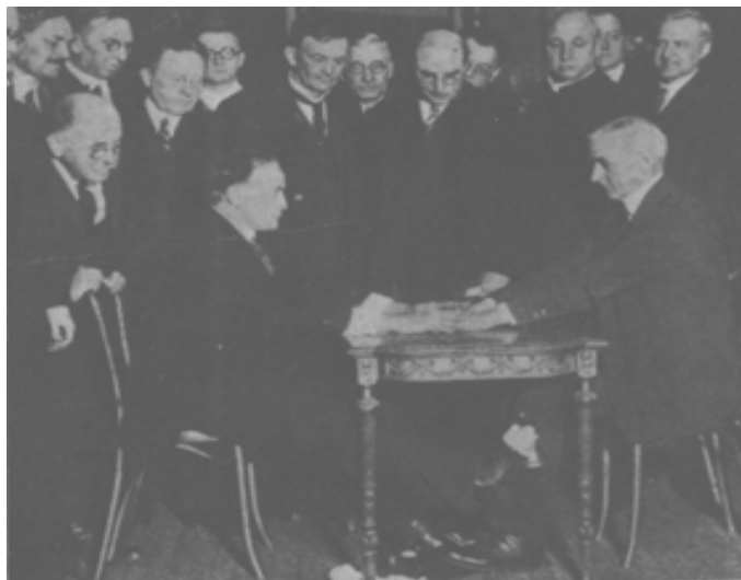
A demonstration in New York by the famed magician Houdini (seated left) captures the interest of a group of ministers, among them C. B. Jernigan (standing at the back corner of the table beside Houdini). Note the magician manipulating something under the table with his foot.