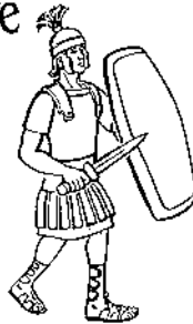
Book 3 Victory through GOD

Based on the Sunday School Lessons published by the AIC Sunday School Committee, Juba, Southern Sudan.