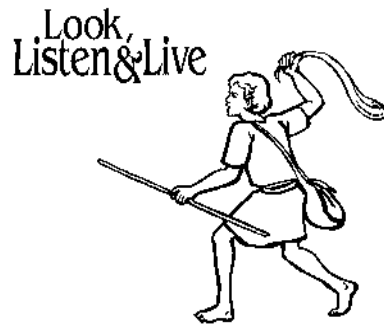
Book 4 Servants of GOD

Based on the Sunday School Lessons published by the AIC Sunday School Committee, Juba, Southern Sudan.